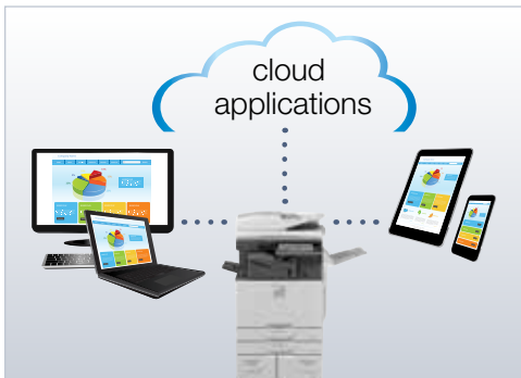
Distribute, access and print documents more easily.