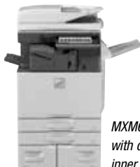
MXM6070 shown with compact inner finisher.

When it's time to get the job done, the Advanced Series monochrome document systems are outstanding performers. Quickly scan documents at speeds up to 200 images per minute . Built-in optical character recognition (OCR) can convert your scanned documents into text-searchable PDFs or Microsoft Office file formats, simplifying your workflow. Use the manual stapling feature on select finishers to restaple your originals. Multiple finishing options give you the output you require, be it stacked, stapled or saddle-stitched. There's even an available built-in stapleless staple feature, which can bind up to five sheets of paper by adding a crimp to the corner of the set, saving regular staples for larger sets.