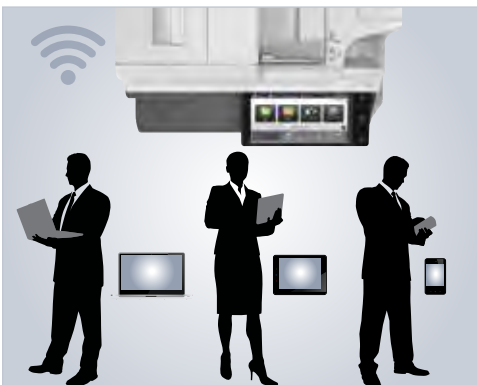
Built-in wireless network interface for convenient scanning and printing from mobile devices.

From paper handling to networking, the MXM5070 and MXM6070 monochrome Advanced Series will exceed your expectations.