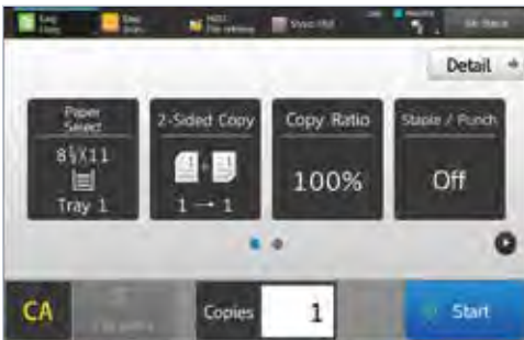
Easy Copy Screen offers the most commonly used settings.