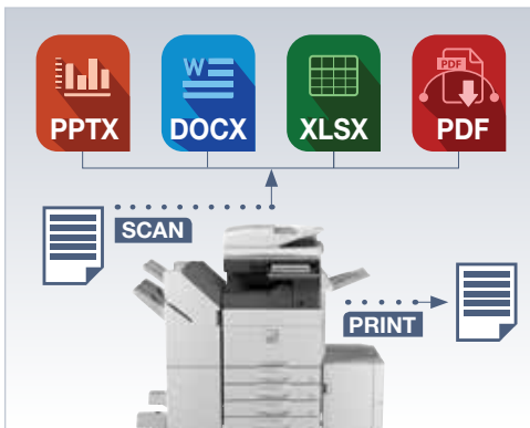
Scan and convert documents to popular file formats seamlessly with Sharp's built-in OCR function.