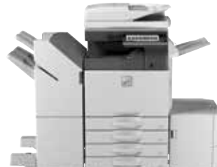
MXM6070 shown with 3K saddle stitch finisher and large capacity cassette.