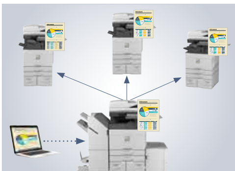
With Serverless Print Release you can securely print a job and release it from up to six Advanced Series models (including host).