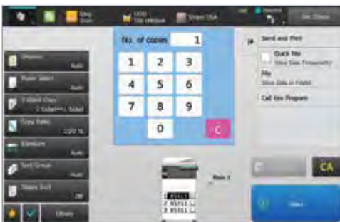
Standard Copy Screen offers more advanced features.